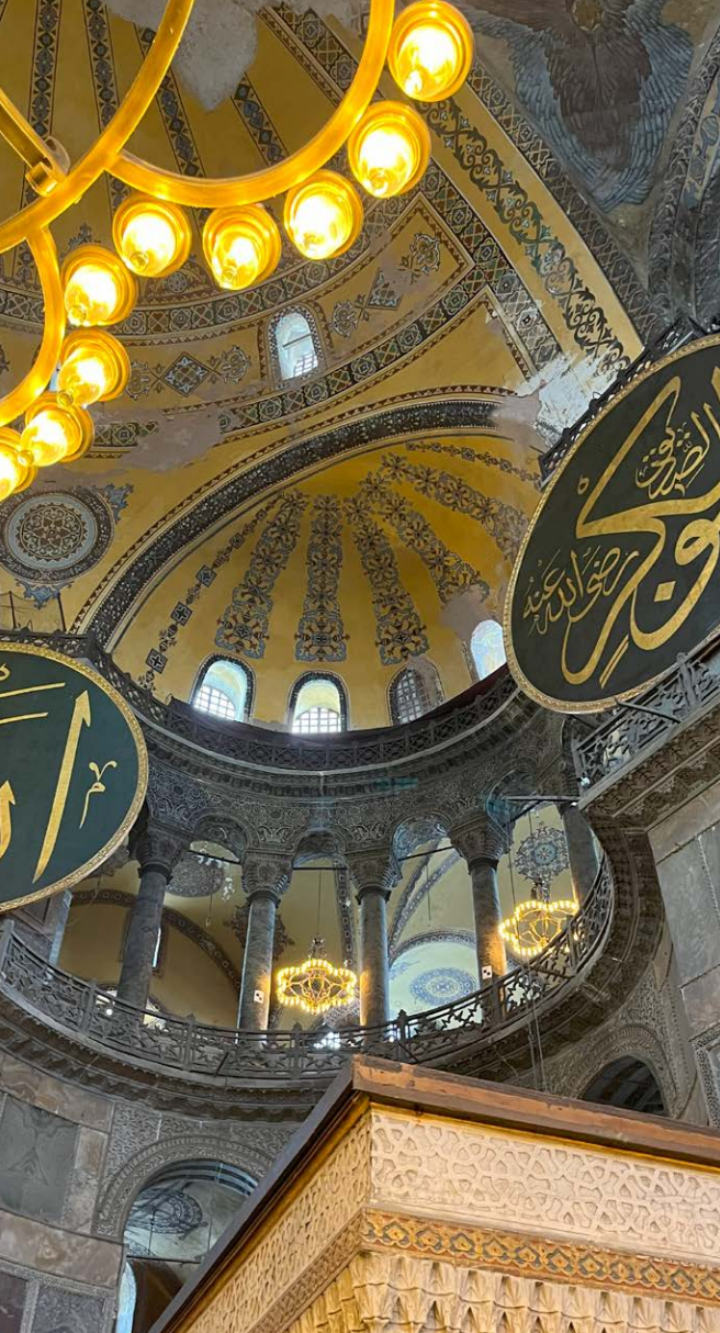
Hagia Sophia, Istanbul