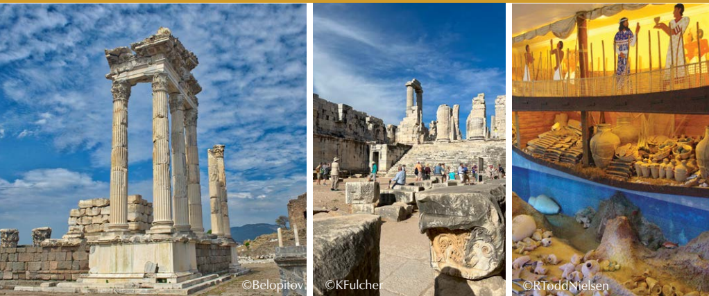
Photos (from left): Pergamum, Didyma, Bodrum Museum of Underwater Archaeology