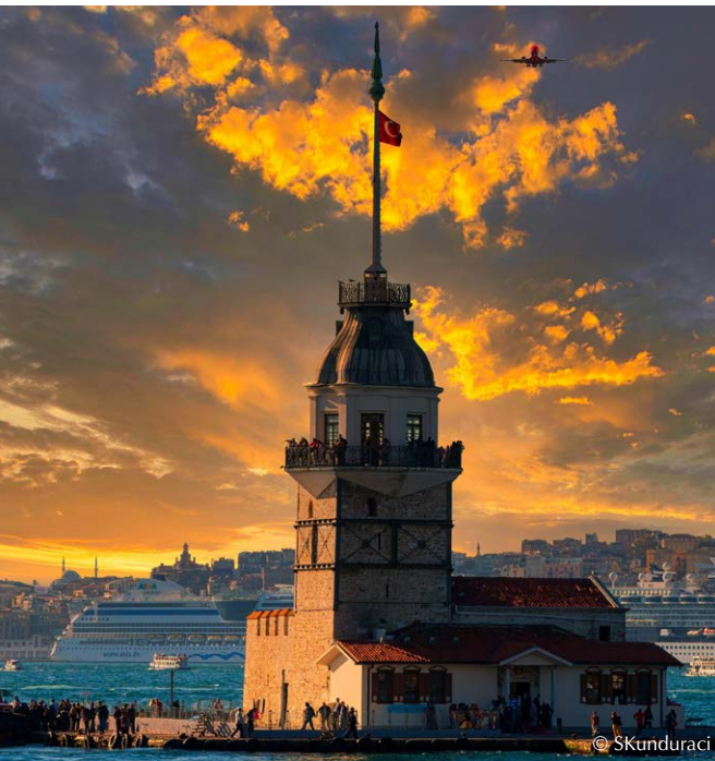
Maiden Tower on the Bosphorus, Istanbul