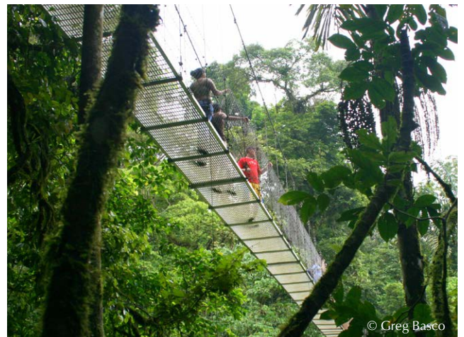
Místico Arenal Hanging Bridges Park