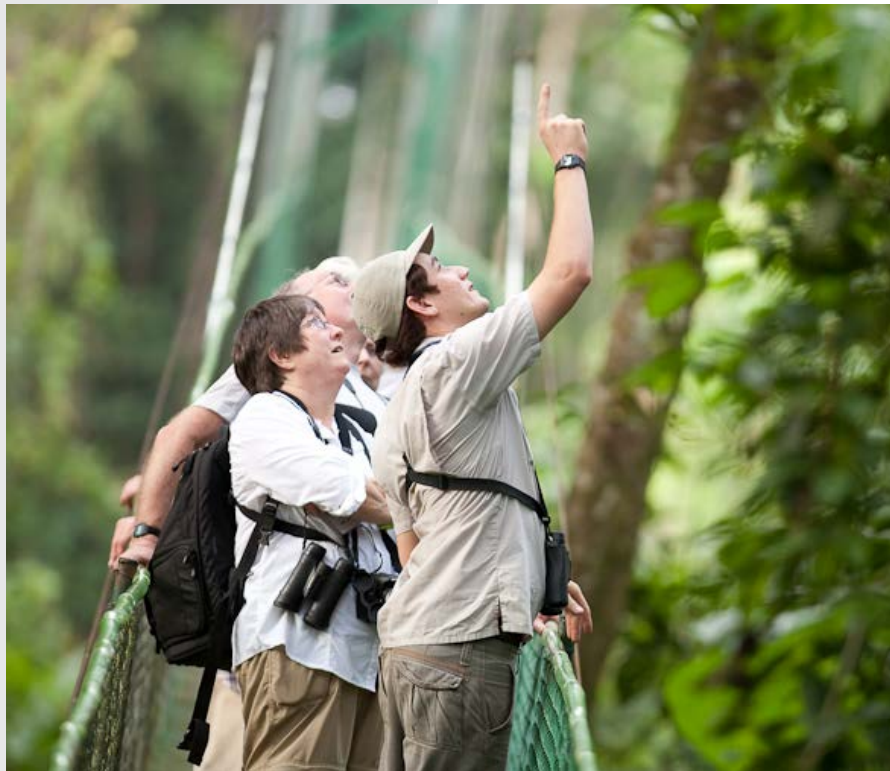
La Selva Research Station