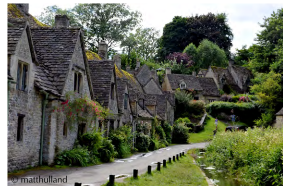
Photos (left to right): Abbey Road sign, Conwy Castle in Wales, The Cotswolds