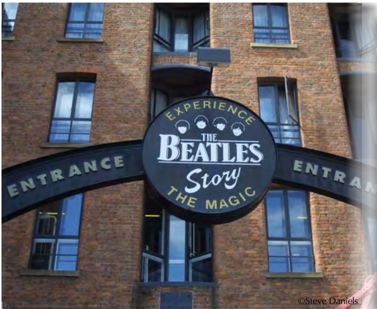
The Beatles Story, Liverpool