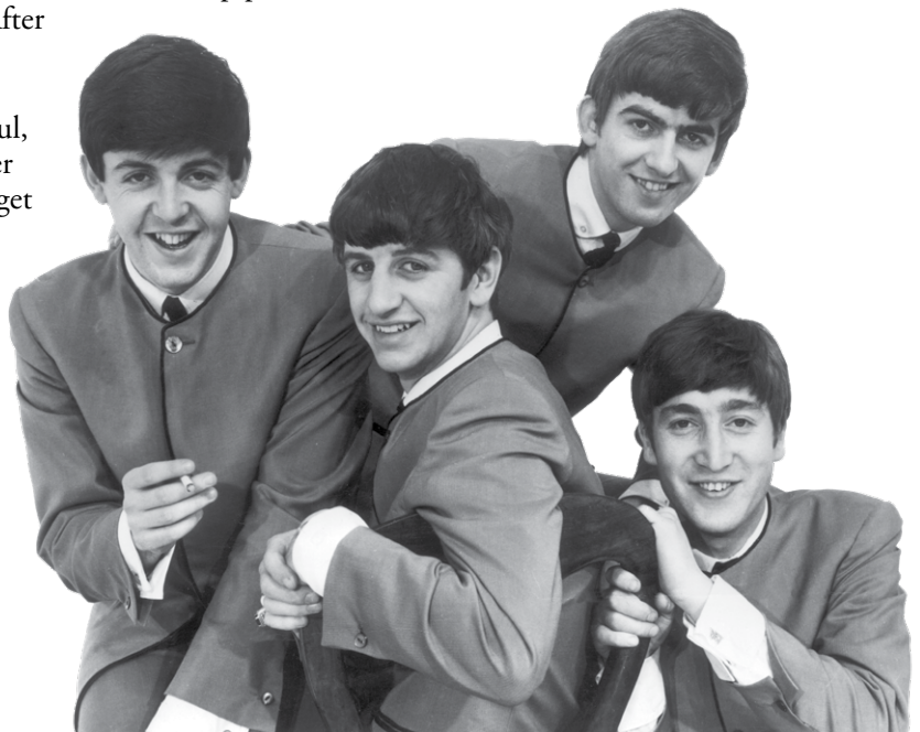
The Beatles' 1963 publicity photo, used on the cover of I Want to Hold Your Hand

Today, we leave the Helter Skelter atmosphere of London behind and enjoy a day trip to the Cotswolds, known for idyllic villages oozing with quintessential English charm. It was here that "Beatlemania" gained momentum from one of The Mop Tops' performances, later becoming a phenomenon with their historic arrival in the U.S. We enjoy time at leisure and turn off [our] mind, relax, and float downstream while visiting a couple of Cotswolds towns, one of them being Stroud where The Beatles played early on in their career. This evening we return to London, where the balance of the day and dinner are at leisure. (B)