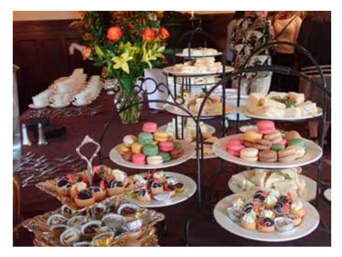
WES Tea at the Stewart House.