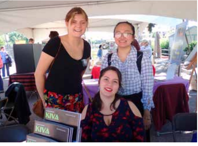
Three Scholars Working the WES Table