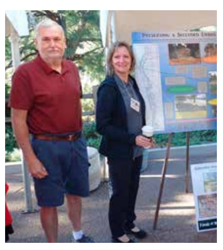
Festival Partners from Trolley Museum.