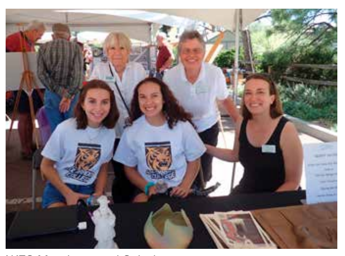
WES Members and Scholars