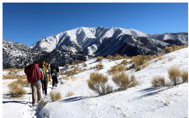
Winter hiking in Great Sand Dunes National Park

In January I went snowshoe-backpacking in the Great Sand Dunes National Park. Due to the government shutdown, there was nobody else in the park, and the roads hadn't been plowed in a while! It snowed on us all day as we hiked in, but we woke up to a gorgeous, clear, freezing morning the next day. On the hike out we stopped to play on the sand dunes - sliding down them on the deep snow they'd accumulated! It was a fantastic adventure, and it goes to show that the outdoors can still be enjoyable in the middle of winter!