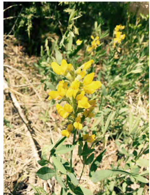
Golden Banner wildflowers