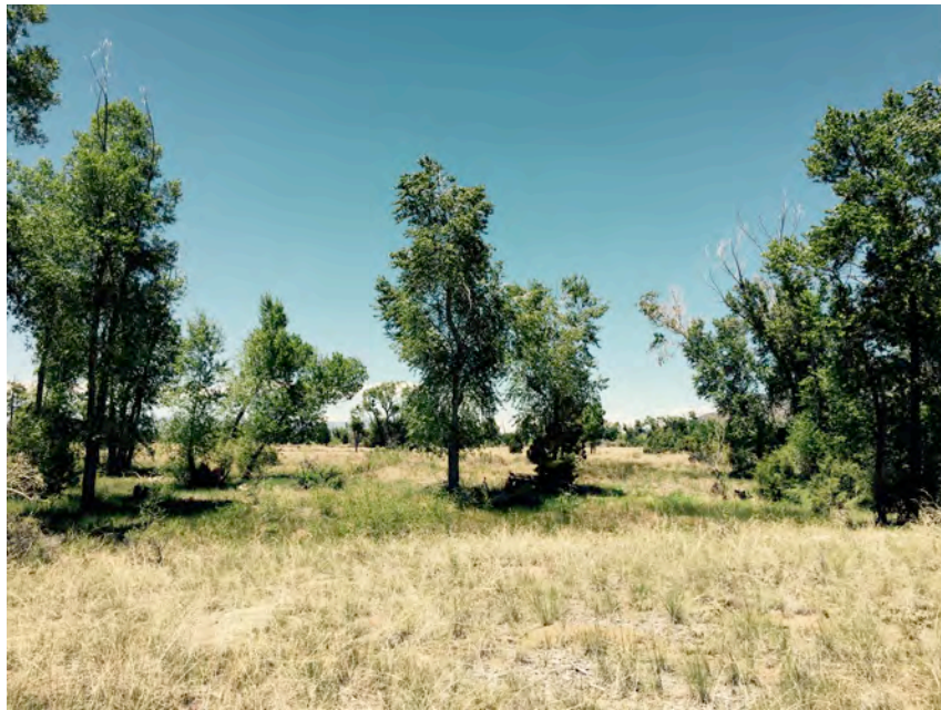
After forest thinning - spring 2015