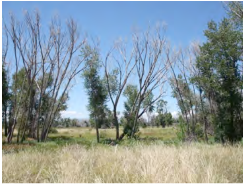
After forest thinning – summer 2007