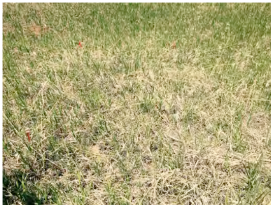
Study Plot on Baca Campus