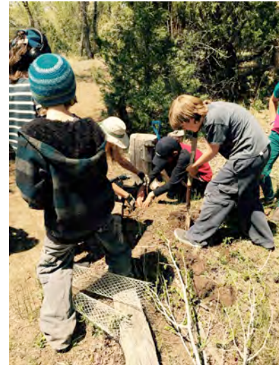
Crestone Charter School students restoring native plant species on the Baca Campus

https://www.youtube.com/watch?v=Zk6RWh2bqXk