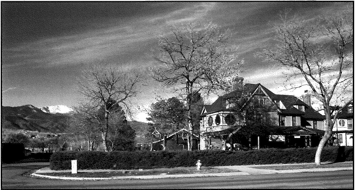
The historic Bemis home was beautifully restored in the late 1970's and is today the Hearthstone Inn, a popular bed-and-breakfast.

Hearthstone Inn