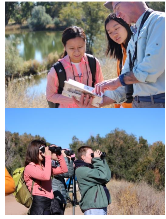
Students birding at Fountain Creek Nature Center on a day trip during Fall 2019.

I first formed Tiger Audubon, CC's birding and conservation club, after attending the National Audubon Society Convention in Wisconsin in 2019. The overall atmosphere of environmental hope and ornithological friendship inspired me to bring Audubon's message back to Colorado College. I was also entering Colorado College as a sophomore-year transfer student and wanted to find a group of friends with a common interest. I have since then become a chair on the Audubon Rockies Board and harbor a strong passion for protecting birds and their habitat, especially in Colorado. Since its 2019 inception, Tiger Audubon has accomplished many goals and undergone numerous activities. In 2019, when events could be held in person, Tiger Audubon visited Fountain Creek, Bear Creek Park, and Stratton Open Space to count birds. The group also contributed community science data to the 2019 Christmas Bird Count in Monument Valley Park and attended birdthemed presentations with the local Aiken Audubon chapter at the Bear Creek Nature Center. 2020, of course, looked a little bit different. Tiger Audubon started social media pages on Instagram and Facebook, where we hosted virtual birding counts, ID contests, and