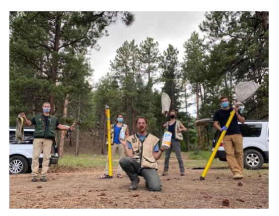
Flam Crew 2020: COVID-19 special edition

As a field biologist, I don't think I ever foresaw the day I would teach an online course, but after Patagonia, that's all I (and most everyone else) have known in the past year! My first experience with Zoom (ever) was in Block 8 Ornithology last Spring, and birding modules produced by the renowned Cornell Lab of Ornithology helped tackle roles usually filled by trips to the Chiricahua Mountains in southeast Arizona. While Zoom also was a major player