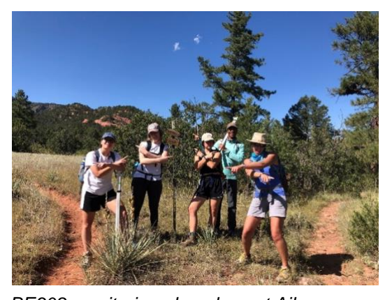
BE308 monitoring phenology at Aiken Canyon – 2019

Another example of adapting OBE courses to online learning is my remote version of BE105, where students use Zoom to view specimens under my microscope and we analyze specimens together in "real time" (you can read more in this CC news article). While many of us prefer the in-person experience, remote learning reminds us that we can do hard science through the pandemic. These humbling times bring me back to a powerful lesson a very wise, Iñupiat woman told me while I was in the Arctic years ago: "life goes on if you let it."