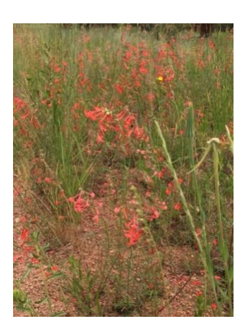
Pink vs. red Ipomopsis -UV tolerance differences?

tolerates UV stress at high elevation with the pigment anthocyanin: anthocyanin is a red pigment that colors flowers and leaves, attracting pollinators and protecting plants from UV stress. We have found evidence that plants at high elevation benefit from less anthocyanin in their flowers to attract a greater diversity of pollinators; however, in decreasing the amount of anthocyanin in their flowers, these plants become less tolerant of UV stress – a tradeoff! I continue to give students a first-hand dose of plant stress in the Sonoran desert with my plant eco-physiology class. Of course, with the pandemic this class was remote last spring - nonetheless, students still learned about stress physiology in plants and analyzed real data from past field trips on how saguaro cacti tolerate thermal stress. Finally, Charlotte, Elsa, and I digitized most of the Carter/Kelso herbarium at CC - you can find this amazing digital resource on our department website.