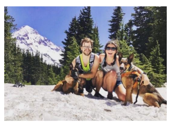
On a road trip in 2019 with our dogs Sasha (left) and Ranger (right)

movement data. Despite leaving the mountains and block breaks behind, I have still found ample time for adventures. My two rescue dogs Sasha and Ranger are always excited to get outdoors! As we begin 2021, I want to take the time to remind everyone this pandemic is not over. I implore everyone to stay physically distant, wear a mask and encourage friends and family to receive the vaccine as soon as it is available for them. As biology students with your knowledge, you can actively combat the misinformation that spreads about COVID-19. Having these conversations will (hopefully) lead to herd immunity and the chance to gather in person again!