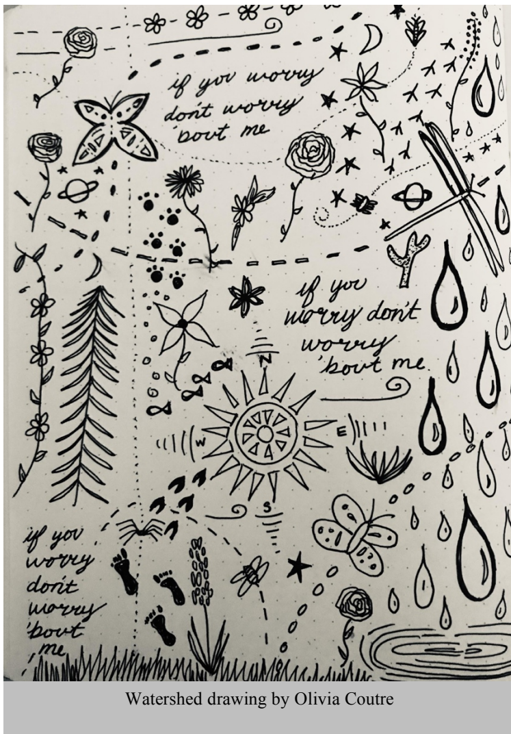
Watershed drawing by Olivia Coutre

currents, flora, fauna, soil, rocks, stars, planets, moons, atmosphere above, and all human and nonhuman interactions it encounters.