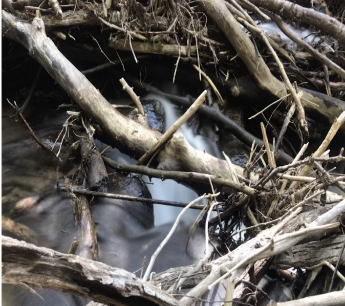
An image from the first spot on the river